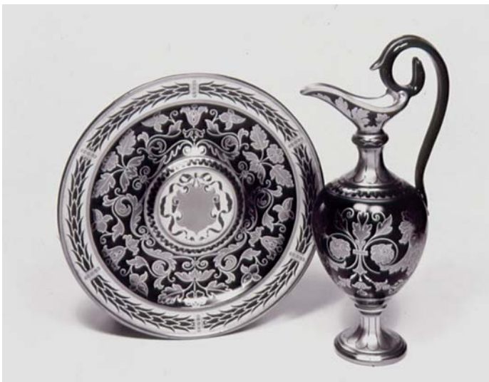
4. Schütz ceramics in Victoria and Albert Museum, London.