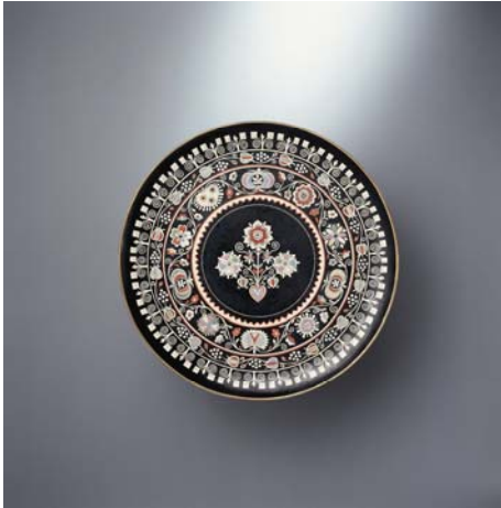
2. Decorative plate, National Museum of Slovenia, inv. no. N 8383.

Ludwig Schütz was very much interested in improving the quality of the products. In order to achieve the best results, he established tight connections with Austrian Museum for Art and Industry and its Art and Crafts school as early as the 1870s. The teachers and professors at the school and museum curators were also the designers and some of them actually painted the Schütz semi-products.