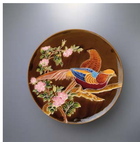
7. Decorative plate, National Museum of Slovenia, inv. no. N 8250.

Nevertheless the total amount of the artifacts in art nouveau style was relatively small, they are very important for Slovenian ceramics production. Schütz ceramics factory was well known for technical innovations and for development of decorative structures. In Slovenia, it was also the first to start using new Art Nouveau floral ornaments and new decorative techniques, thus significantly changing its production program. Because of that, this is a good example for the illustration of production, creativity and implementation of ornamental elements from nature in Slovenia.