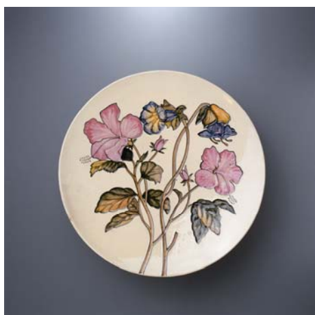
8. Decorative plate, National Museum of Slovenia, inv. no. N 8809.