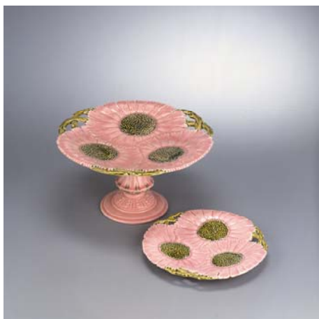
6. Footed tray with dessert plates, National Museum of Slovenia, inv. no. N 8757.

Hungary. Besides them, decorative plates were painted with flowers. Also desert services with stemmed bowl or plate, and desert plates were among Schütz art nouveau products. The most popular floral ornaments were water lilies, poppies, thistles, cyclamens, and sunflowers.