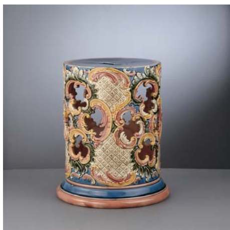
1. Tabouret, National Museum of Slovenia, inv. no. N 8347

A different example is Slovenian leading ceramics factory, namely Brothers Schütz Ceramics Factory in Liboje near Celje. The factory was renowned in the scope of the Austro-Hungarian Empire as the producer of fashionable table vessels and other ambitiously designed wares. In the field of design it collaborated with Austrian Museum for Art and Industry (today MAK). Schütz ceramics factory was well known also for technical innovations and for development of decorative structures. In Slovenia, it was also the first to start using new Art Nouveau floral ornaments and new decorative techniques, thus significantly changing its production program and technology. Because of that, this is a good example for the illustration of production, creativity and implementation of ornamental elements from nature in Slovenia.