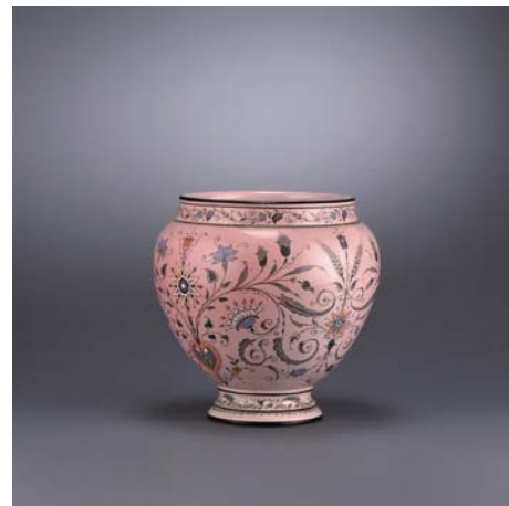
3. Cachepot, National Museum of Slovenia, inv. no. N 8716